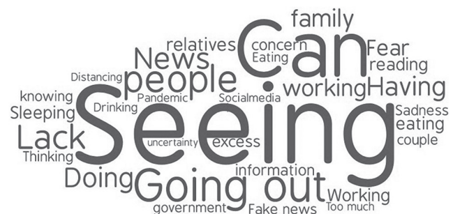
Figure 1. Word cloud of related actions that made the population feel bad during lockdown.

As expressed in the responses analyzed, being confined due to lockdown caused significant stress in the population during this first stage. For example, overexposure to the news, watching television or violent or sad series, oversaturation of information on the pandemic in social networks (numbers of deaths), finding out about acquaintances with COVID-19, financial difficulties, violence and insecurity, unemployed people, fake news in social networks and the media, price increases, perception of an inconsistent attitude by the government towards the pandemic, as well as attacks on health personnel made subjects angry. Other implications were related to the adoption of unhealthy habits such as overeating, sleep disturbances, and neglecting personal hygiene.