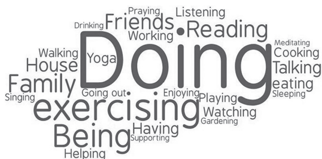
Figure 3. Word cloud of related actions that made the population feel good during lockdown.

From the point of view of the subjects, lockdown involved positive experiences as observed in the word cloud (Figure 3). The most frequently mentioned words in the responses were: doing, exercising, family, being and reading. Home and family life had the highest frequency of replies.